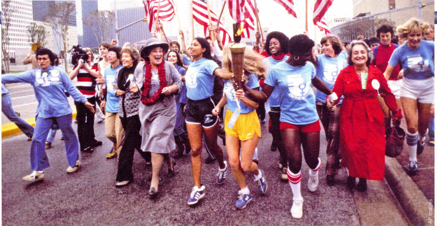
Feminism gained political clout in the 1970s — about the same time men began losing due process rights. Here some feminist leaders, including feminist writer Betty Friedan (in red coat), participate in carrying a torch from New York to Houston, Texas, to the 1977 National Women's Convention.